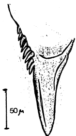
Fig. 1. Normally denticulated lateral tooth of the radula of C. nobilis (Station 193//detail)

C. nobilis were found at one station in Dvinsky Bay (cruise no. 6) and at five stations in Kandalaksha Bay (cruise no. 7). All material was preserved in 70 percent alcohol.